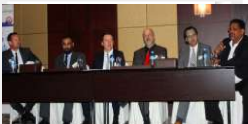
Panelists at the conference discuss the next level of safety specification standards

Trinity Qatar, the contracting arm of Dubai based engineering conglomerate Trinity Holdings, showcased its range of products and services related to building safety and maintenance on the sideline of Safety Design in Buildings conference held on Monday, Feb. 18, at Renaissance Doha City Center Hotel, in Qatar.