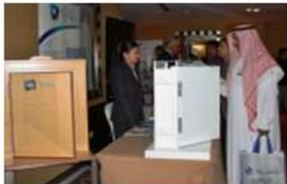
(MENAFN Press) Doha, February 18, 2013:

HeraldLand.net Buy Land in London from $23,500. Call our Dubai office for more info AdChoices