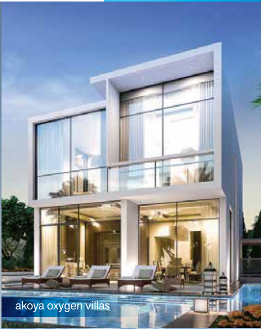
akoya oxygen villas