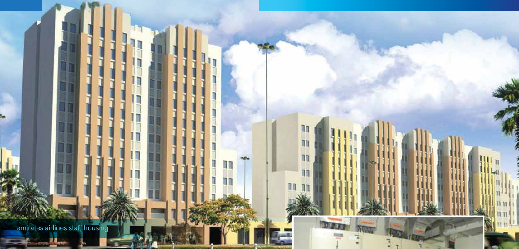
emirates airlines staff housing