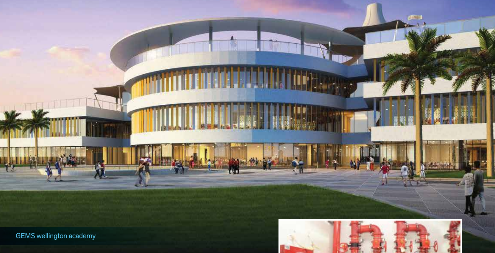
GEMS wellington academy