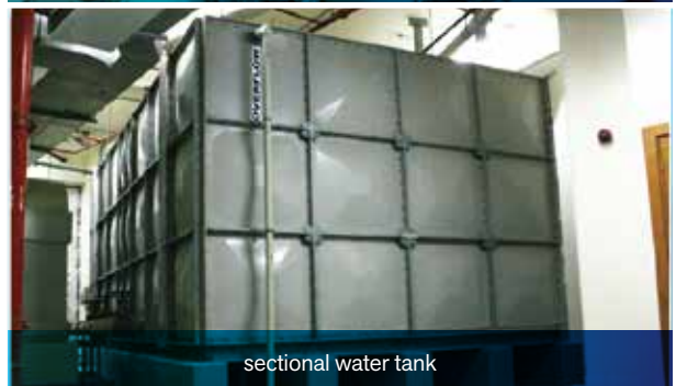
sectional water tank