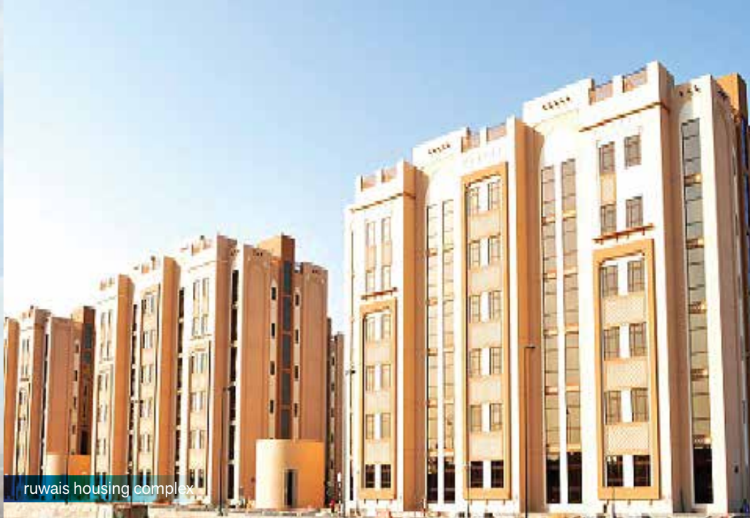
ruwais housing complex