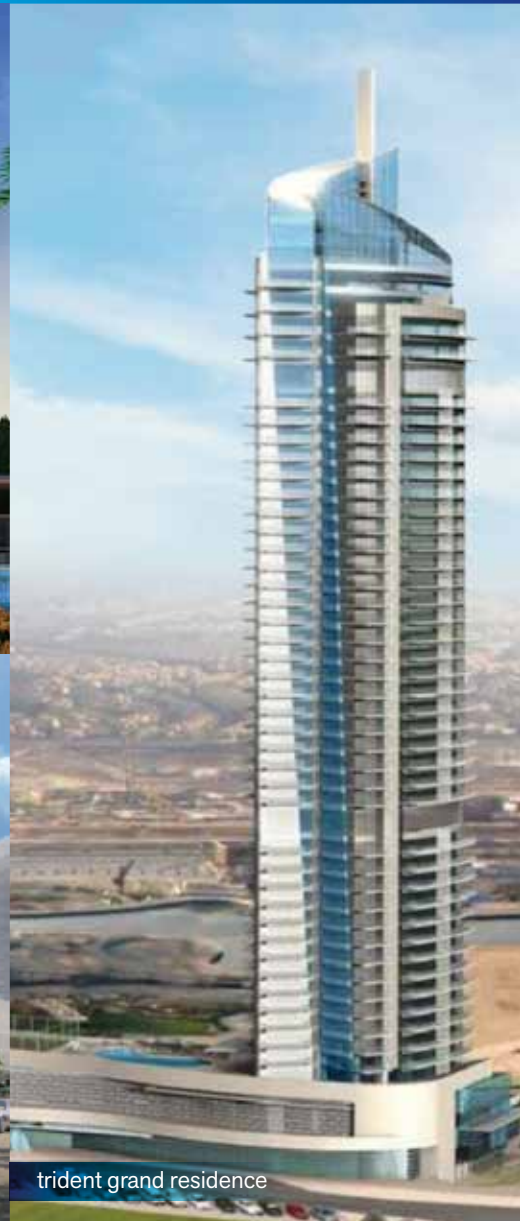
trident grand residence