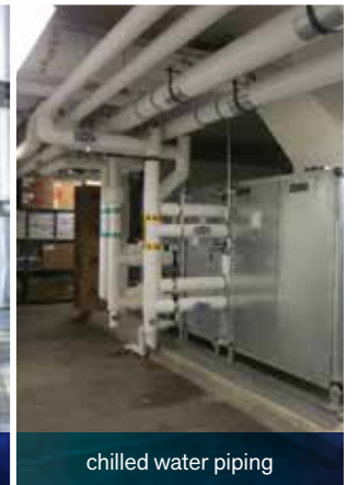
chilled water piping