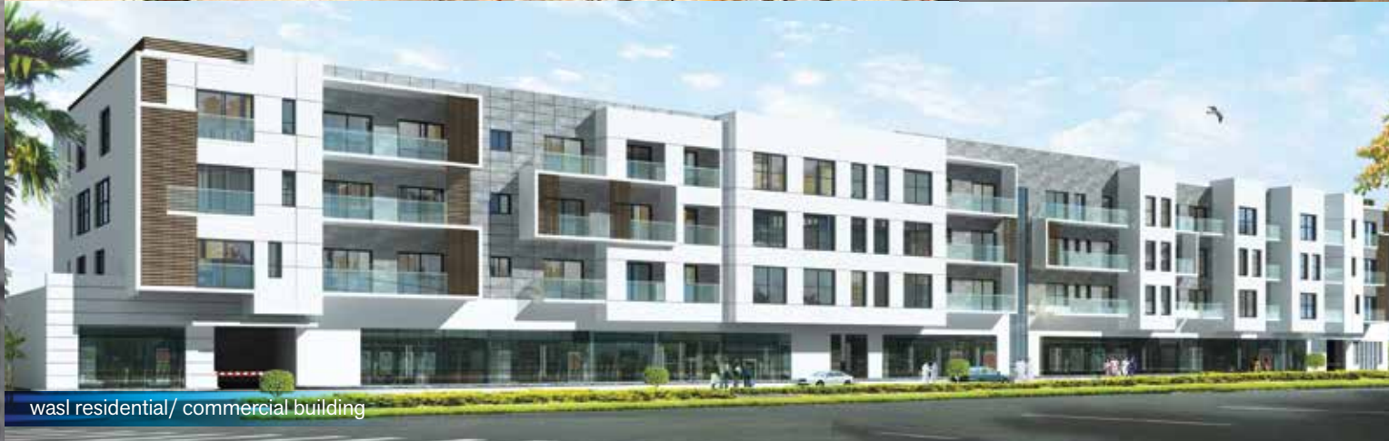
wasl residential/ commercial building